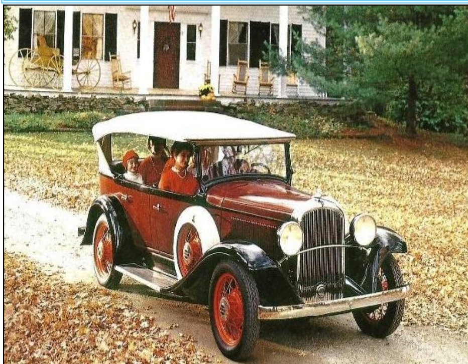
An Olney Sunday Outing

2011 MEMBERSHIP DUES, $30.00 PER YEAR ARE NOW PAYABLE TO MEMBERSHIP SECRETARY