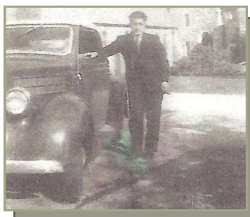
1936 Honeymoon Ford convertible