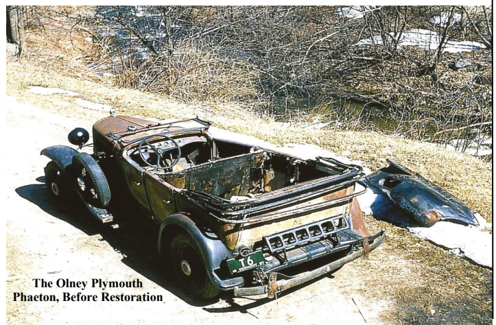
The Olney Plymouth Phaeton, Before Restoration