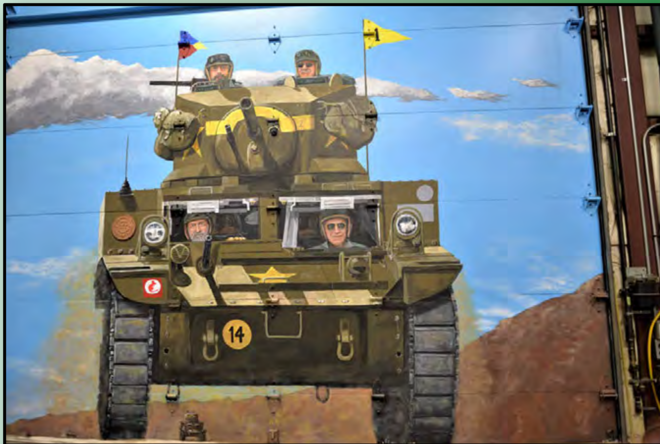
A Small Sample of the Vermont Military Vehicle Club... Can anyone ID where and who the "driver" might be?

Check the date after your name, Your VAE Membership might need to be renewed.