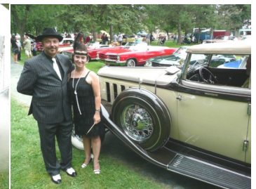
The Fashion show