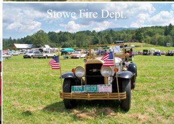
Stowe Fire Dept.