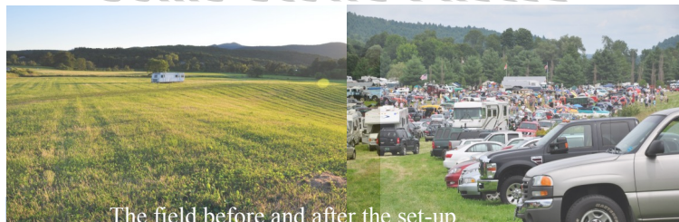
The field before and after the set-up