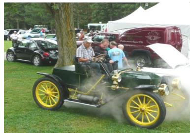
The 100 year old Stanly Steamer