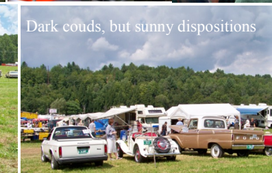
Dark clouds, but sunny dispositions