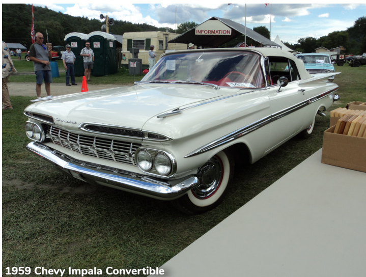
1959 Chevy Impala Convertible