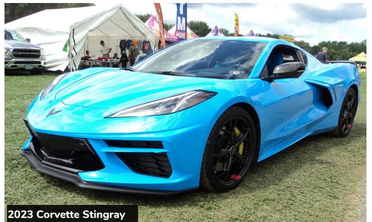
2023 Corvette Stingray

For more information visit www.discoverwaterbury.com .