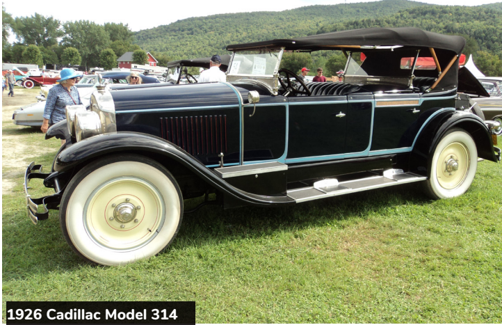
1926 Cadillac Model 314