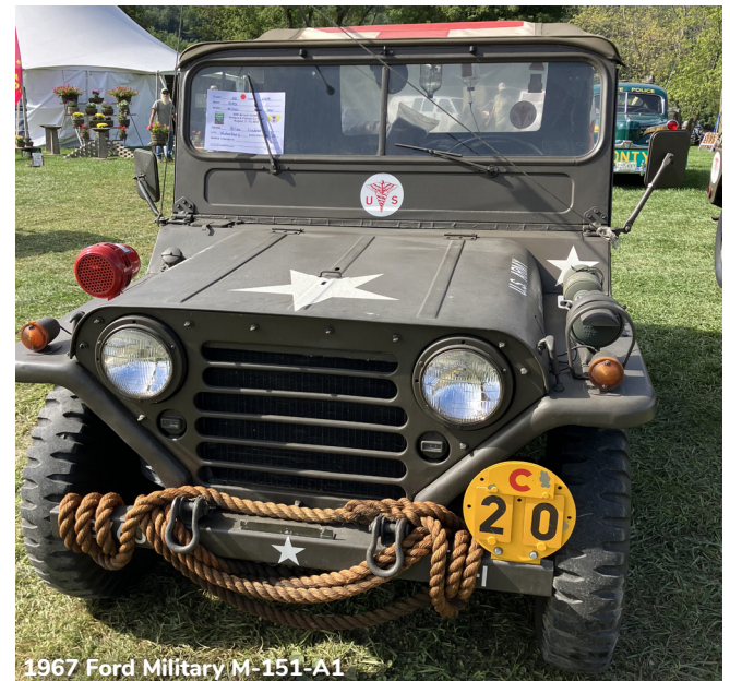
1967 Ford Military M-151-A1