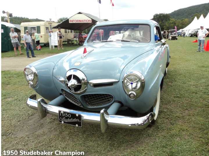
1950 Studebaker Champion