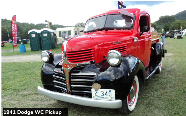
1941 Dodge WC Pickup