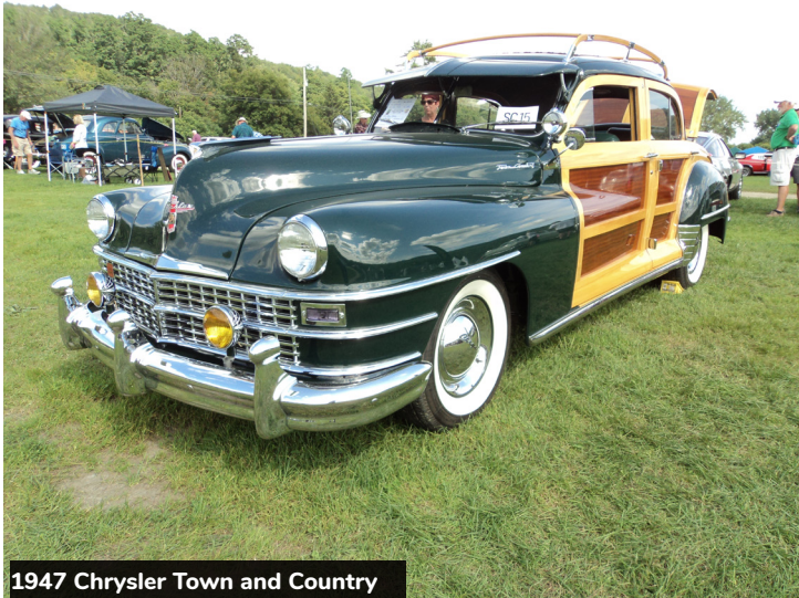
1947 Chrysler Town and Country